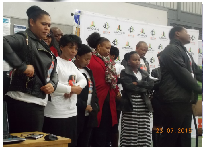
Call Center team.

Centlec held a memorial service on the 2nd of June and on the 23rd of July 2015.