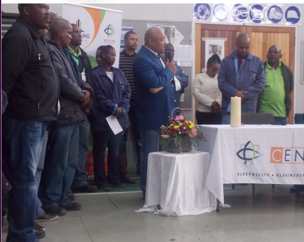
Medium Voltage team.