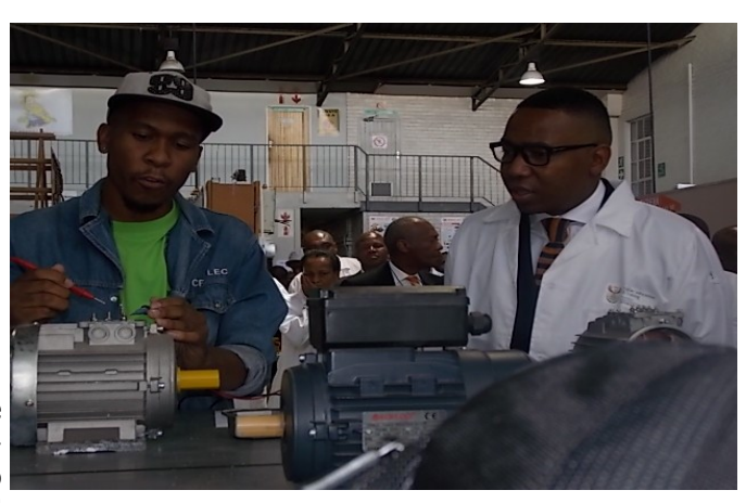
DEPUTY MINISTER OF EDUCATION MR Mduduzi Manana at Centlec training center.

.The initiative is part of the department's implementation and contribution to skills development and consequently job creation. "The establishment of a dedicated department in 2009 was to focus on high- indirectly by providing a shortages", skilled people to a skills- page 2) starved economy, but also